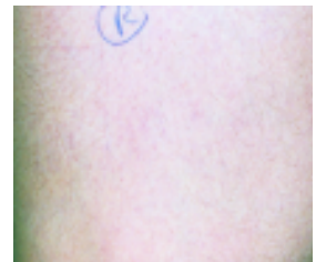
Before and After Leg Vein Treatment