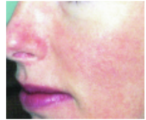
Before and After Photo Rejuvenation