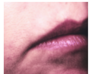
Before and After Restylane Treatments