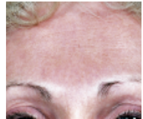
Before and After Botox Treatments