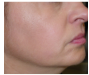
Before and After Thermage