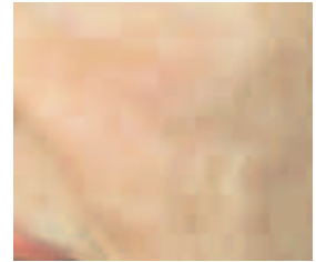
Before and After Fraxel