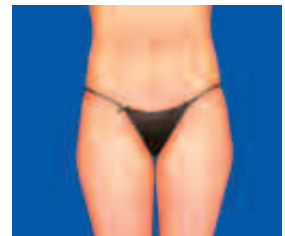
Before and After Zerona