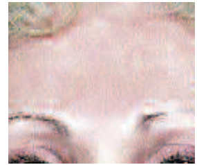
Before and After Botox Treatments