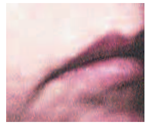
Before and After Restylane Treatments